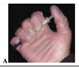
Table 4. Intranasal Vaccination